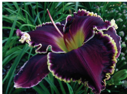
WILKINSON SEEDLING 09-9B

The only requirements for joining the group are being a member of the American Hemerocallis Society (we are an "official" AHS Robin so they ask that of us), having an e-mail account