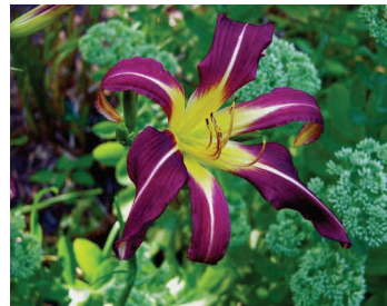
CHARON THE FERRYMAN BACHMAN 2003