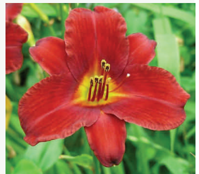
FOUNTAIN OF BLOOD HUBEN 2012