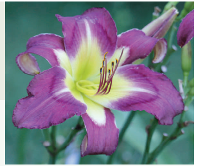
PURPLE CHEETAH GOSSARD 2006

Next NEDS Meeting - Saturday, January 10, 2015 at Tower Hill Botanic Garden, Boylston, MA