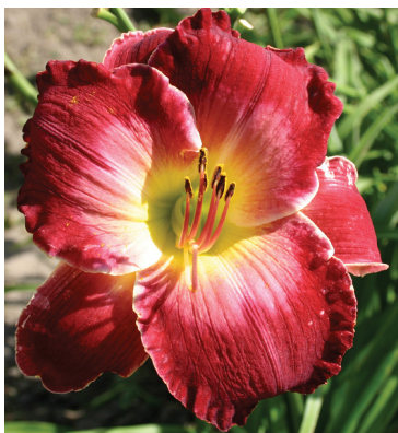
SCARLET SUMMER (Lorrain/Lycett'07) Tet 36" Mla-RE-FR-Dor 6" Cherry scarlet with white washed scarlet halo; 20 buds, 4 branches. Value: $30