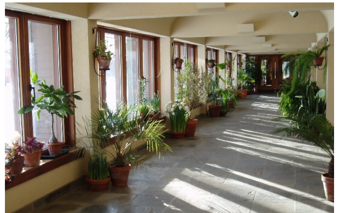
Hallway at Tower Hill

As a daylily society member and a daylily collector, I am always on the watch for what is new and exciting in the world of daylilies. For me, the most awesome part of this 400-page encyclopedia are the ninety pages devoted to seedlings, that is, plants still under evaluation and not yet registered with AHS. They are the future. Daylily addicts might well label them, flowers to die for. Their photographs and descriptions are arranged alphabetically by hybridizers' last names. By viewing these cultivars, the reader gains insight into future releases, and this reader, in particular, now knows exactly whom to contact to blow future daylily budgets! How lucky I am that my Little Sweetheart gifted me such a beautiful, comprehensive reference book that weighs almost as much as he does and that he also seems to adore.