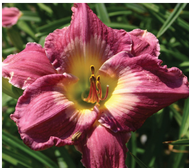
CANADIAN SUMMER (Lorrain/Lycett'06) Tet 29" M-RE-VFR-Dor 6.5" Lavender with slate blue eye above chartreuse green throat; 17 buds, 3 branches. Value: $30