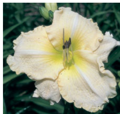
TIMELESS PASSION (Lorrain/Lycett'05) Tet 24" Mla-FR-Dor 6" Pale yellow self above chartreuse throat; 10 buds, 2 branches. Value: $20