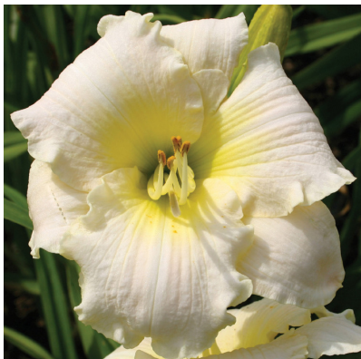
SNOWY SENSATION (Lorrain/Lycett'07) Tet 33" Mla-VFR-Dor 5.5" Cream self above yellow throat; 18 buds, 3 branches. Value $30