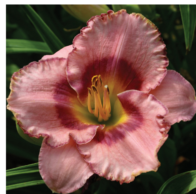
SUMMER SIDEKICK (Lorrain/Lycett'07) Tet 22" L-RE-FR-Dor 5" Pink with raspberry eye and edge above yellow green throat; 17 buds, 4 branches. Value: $30