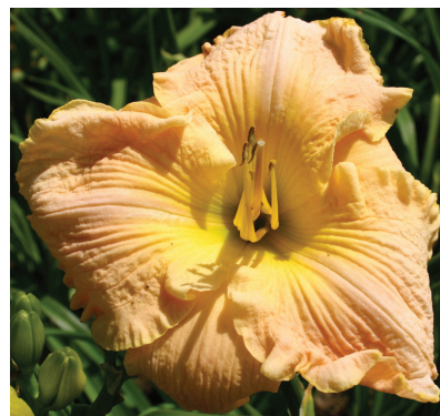
SONG AND DANCE (Lorrain/Lycett'07) Tet 26" EM-EV-FR 6.75" Pink melon blend above chartreuse throat; 18 buds, 2 branches. Value $35