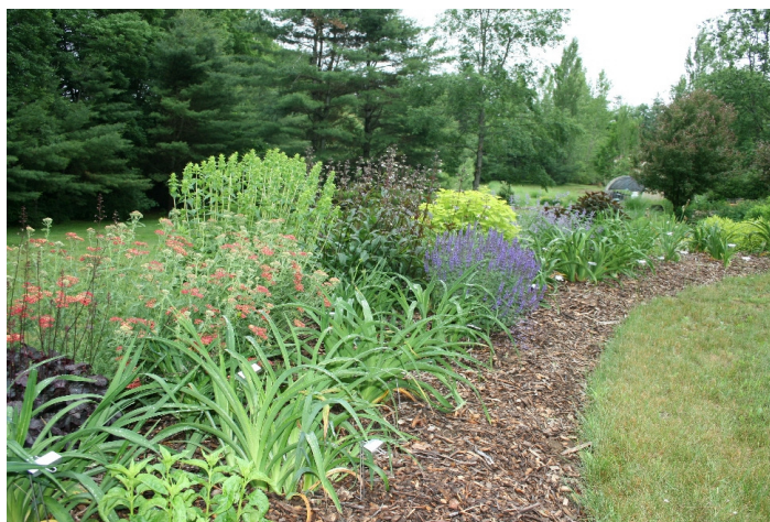
Achillea, Phlox, Salvia, Caryopteris, etc. in daylily display bed

I'd like to do an article for the bulletin and show pictures of daylilies and “companions” that work well together. Please send me your ideas and photos by March 1 and your pictures will be credited