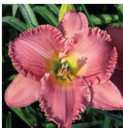
FEEL THE MUSIC (Rich 2011)

Tet, Dormant, 34 inches tall, 6 inch bloom, early-mid season, 4 way branching with 20 buds, fragrant (Vatican City X Promise to Behave) Deeply saturated blackberry wine red heavily overlaid in black velvet. Wide ruffles and a fine wire edge of white. Value $75.00