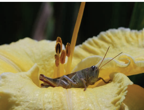
1ST PLACE—GRASSHOPPER ON ELEANOR ROOSEVELT