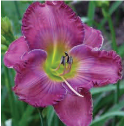
SECRET KEY (Rich 2014)

Tet, Dormant, Mid, 6" bloom, 34" tall, CMO 3 to 6 way branching and 18 to 30 buds. Intense deeply saturated crimson red textured with blue black velvet $100.00