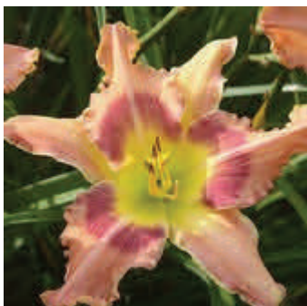
RASPBERRIES FOR BREAKFAST (Mason 2011)

Height 26", bloom 6", blooms midseason, Reblooms. Semi-evergreen, tetraploid, fragrant. 15 buds, 3 branches. Dark purple with an etched faint dark lavender eye and edge plus ivory or ivory gold sharks teeth above a yellow to green throat. Fertile both ways. (((Chance Encounter × Shaka Zulu) × ((Fortune's Dearest × Lifting Me Higher) × Doyle Pierce)) × (Heartbeat of Heaven × sdlg)) Value: $65