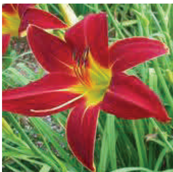
FRED'S RED (Murphy 2012)

Height 46", bloom 6.5", blooms late season. Dormant, diploid. 32 buds, 6 branches. Unusual form cascade. Ruffled lavender with a lighter cream watermark, faint lemon midribs and a very narrow cream edge above an apricot throat. Sunfast at 101°. Pollen fertile; pods difficult. (Margo Reed Indeed × North Wind Dancer) Value: $80