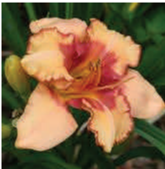
KNOLL COTTAGE PROPER LADY (Jones, Lori 2012)

Height 44", bloom 7", blooms very late. Semi-evergreen, diploid. 34 buds, 5 branches. Dark red star with a green and yellow throat and yellow midribs, Very long bloomer. Sun resistant. Bud builder. Very fertile. (Benzinger sdlg × Benzinger sdlg) Value: $60