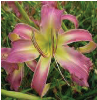
JOANNE MCCORMICK MURPHY (Murphy 2012)

Height 50", bloom 9", blooms midseason late. Dormant, diploid. 24 buds, 3 branches. Spider Ratio 5.00:1. Light yellow dusted with rose stippling above a green throat. Sepals and petals roll. (Kirsten Madeline Burkey × North Wind Dancer) Value: $35