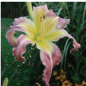
SHENANDOAH SUNRISE (Reed 2012)

Height 26", bloom 6.5", blooms midseason late. Semi-evergreen, tetraploid, fragrant. 20 buds, 3 branches. Clear dark purple with a lighter lavender purple watermark and ivory white edge above a yellow to green throat. Fertile both ways. (sdlg × sdlg) Value: $135.00