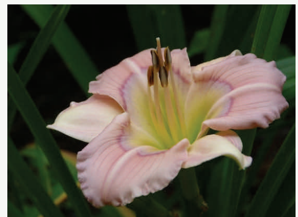
3RD PLACE BABY BLUE EYES