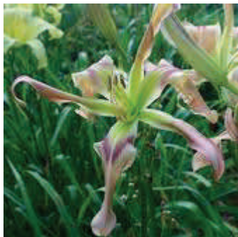
RAIN SPLASH (Reed 2012)

Height 40", bloom 7", blooms midseason. Dormant, diploid. 24 buds, 4 branches. Unusual form crispate. Peach pink with a raspberry rose eyezone above a large intense green throat. Petals recurve, sepals roll and quill. Fertile. (Peacock Curls × Heavenly Curls) Value: $75