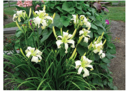
3RD PLACE—ISABELLE ROSE