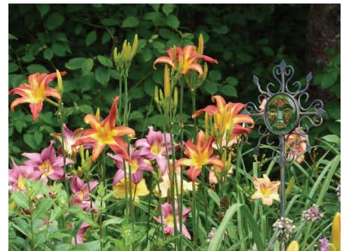
3RD PLACE—GLASS SUN