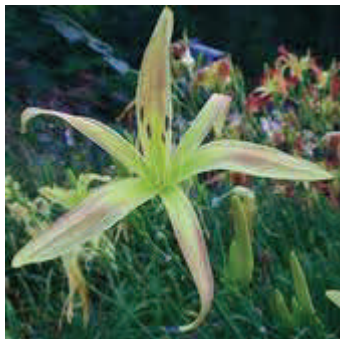
ALIEN STARDUST (Reed 2011)

Height 50", bloom 9", blooms midseason late. Dormant, diploid. 24 buds, 3 branches. Spider Ratio 5.00:1. Light yellow dusted with rose stippling above a green throat. Sepals and petals roll. (Kirsten Madeline Burkey × North Wind Dancer) Value: $35