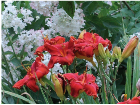
2ND PLACE—JOHN PHILIP SOUZA