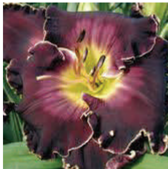
SOLI DEO GLORIA (Emmerich 2012)

Height 30", bloom 7", blooms midseason. Semi-evergreen, tetraploid. 15 buds, 3 branches. Fertile both ways. Peach pink with large raspberry eye and ruffled toothy edge. (Gram's Dream × Time Warp) Value: $50