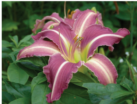
1ST PLACE—TANNER SEEDLING 68-3