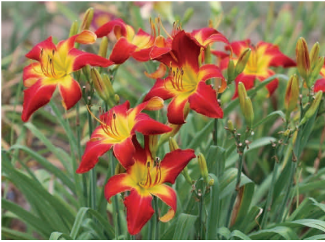
1ST PLACE—ALL AMERICAN CHIEF