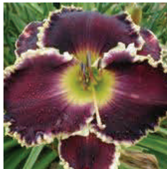
SKIN OF MY TEETH (Emmerich 2012)

Height 40", bloom 7", blooms midseason. Dormant, diploid. 24 buds, 4 branches. Unusual form crispate. Peach pink with a raspberry rose eyezone above a large intense green throat. Petals recurve, sepals roll and quill. Fertile. (Peacock Curls × Heavenly Curls) Value: $75