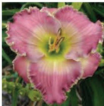
LIVING WATER (Emmerich 2012)

Height 52", bloom 8", blooms early midseason. Dormant, diploid. 23 buds, 3 branches. Unusual form cascade. Bud builder. Cream pink with a feathered purple eye, cream midribs above a chartreuse throat. Fertile. Sunfast at 102°. Opens well at 50°. (Monacan Trail × Just Jessie) Value: $75