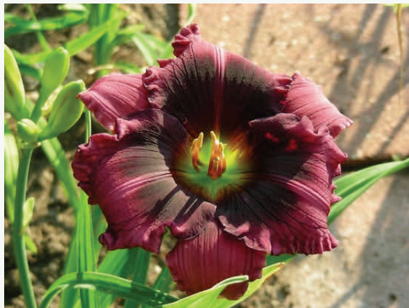
1ST PLACE (TIE) - JOSEPH HERMAN