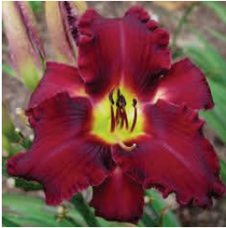
WITCH HOLLOW (Rich 2015)

Tet, Dormant, Mid, 6" bloom, 34" tall, CMO 3 to 6 way branching and 18 to 30 buds. Intense deeply saturated crimson red textured with blue black velvet $100.00