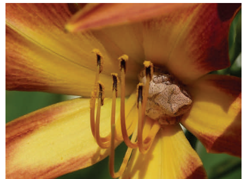
3RD PLACE—FROG