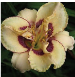
MAN IN THE MAZE (Rich 2013)

Tet, Dormant, 34" tall, 5 1/2 " bloom, Early-Mid. Deep rose with an eye of light and dark fuchsia purple. Value $75.00