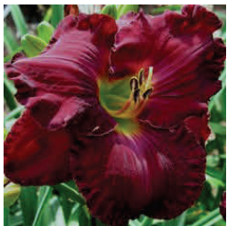
WEST OF THE MOON (Rich 2012)

Tet, Dormant, 33" tall, 7-1/2" bloom, Mid-Late, 3 + 4 way branching with 16 -20 buds, fragrant. Extra-large lilac rose Shoulda been a round form, Coulda been a spider if it were skinnier and Woulda been a crispate UF if the petals pinched consistently. Value $75.00