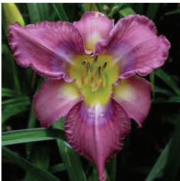
SHOULDA, COULDA, WOULD A (Rich 2013)

Tet, Sev, 29" tall, 4 1/2" bloom, Early - Mid, 3 + 4 way branching with 15 -18 buds. Light lemon and cream bicolor with a patterned eye. Value $75.00