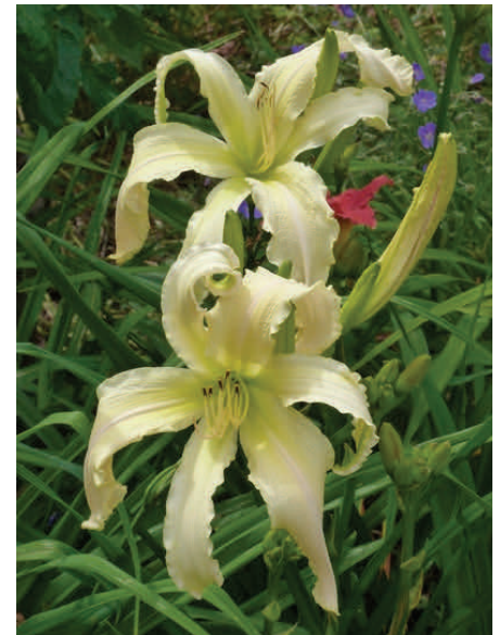
3RD PLACE—TANNER SEEDLING 824-5