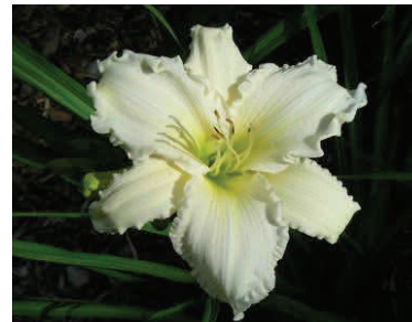
TIP OF THE ICEBERG - DOUGLAS, H 09