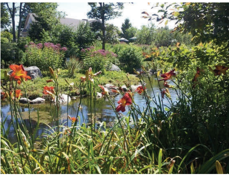
1ST PLACE—MAINE BOTANICAL GARDEN