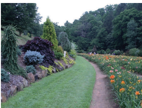
2ND PLACE—BLUE RIDGE DAYLILIES