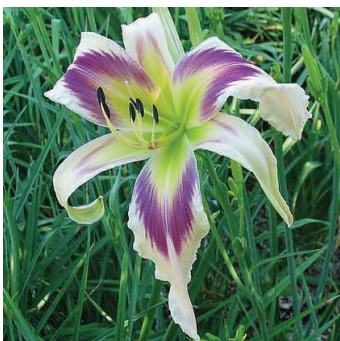
HEAVENS TO MURGATROYD (Murphy 2011)

Height 29", bloom 5.5", blooms early midseason. Semi-evergreen, tetraploid. 13 buds, 3 branches. Peach with a raspberry eye and raspberry edge on petals above a yellow to green throat. Pod fertile. (Fanciful Candy × Lady Dancer) Value: $35