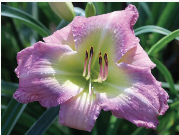
2ND PLACE - SWING FEVER