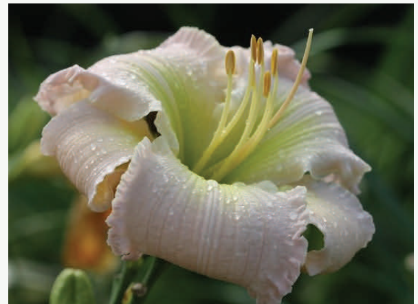
1ST PLACE (TIE) - CAN YOU DIG IT