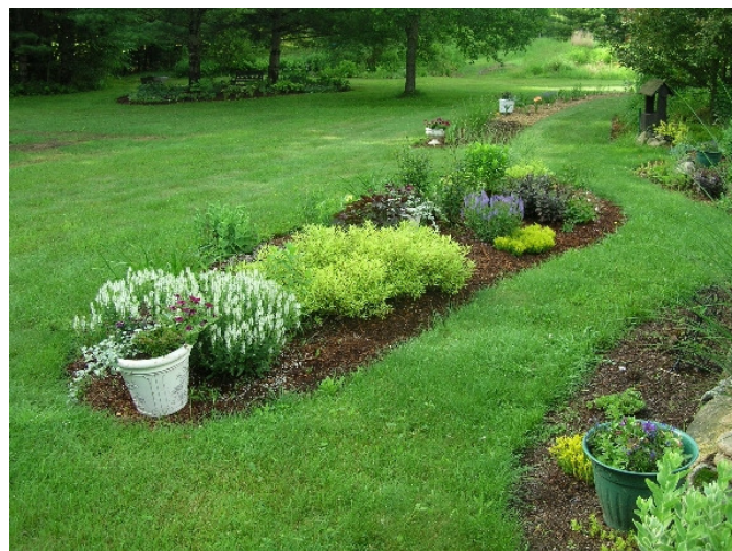
Day Dream Gardens, Deering, NH --an open garden—photo by Deb Carpenter

9:00 am - 11:00 am Garden Judge Workshop II at Harmon Hill Farm, 49 Ledge Rd., Hudson, NH (daylily tour garden)