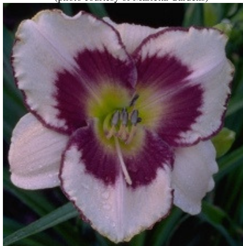
Topguns Alice Langley

(Shooter, E. '99) Dip 20" M-RE-Sev 4" Light purple lavender, purple veins, blue watermark Value: $30