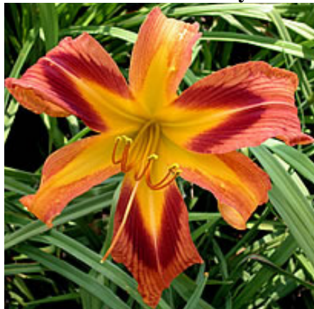
Cathy Cute Legs

(Shooter, E. '05) Dip 34" M-RE-Sev 9" , Red-orange chevron, red-orange eyezone, chestnut veining Value: $75