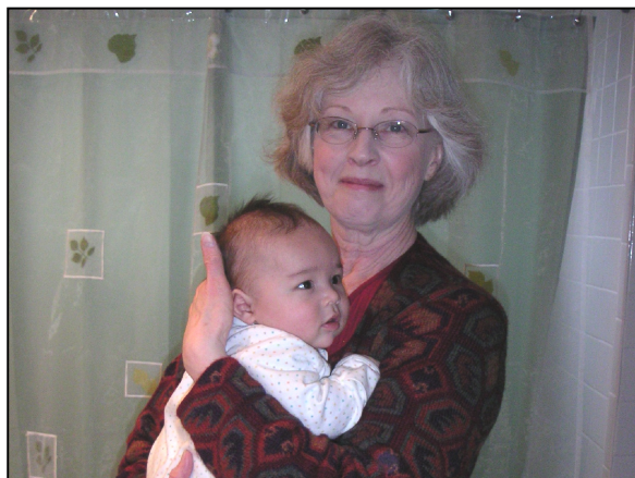
Gramma and her new helper