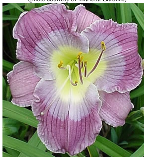
Baby Blue Eyes

(Shooter, E. '05) Dip 34" M-RE-Sev 9" , Red-orange chevron, red-orange eyezone, chestnut veining Value: $75