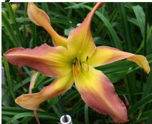
WHIP CITY UP IN SMOKE (Jones, L., 2011) Semi-evergreen, tetraploid, blooms midseason. Height:

33", bloom size: 8". 3 way branching; 12 buds. Pale lavender-mauve in the morning changing to gold in the afternoon. Pod and pollen fertile. (RED SUSPENDERS x CAMEROONS) UFO crispate. Value: $50