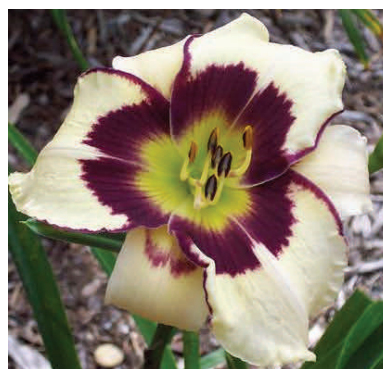
A GATHERING OF ANGELS DOUGLAS, C 06

As you can see, Condition and Grooming is very important. You can lose up to 15 points if your exhibit is not groomed properly, i.e. brown on the scape, pollen on the petals, etc.