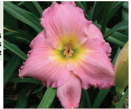
ELEGANT PINK BEAUTY BENZ '05