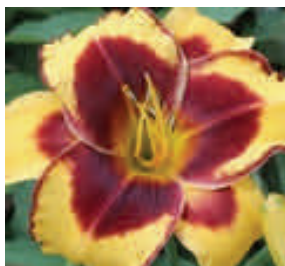
SUN PANDA Culver '09