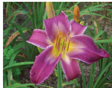
ALAKAZAM— HANSON '98

Saturday, August 22, 2015 — NEDS Plant Sale—10 AM (setup at 8 AM), Auction at 12:30 PM at Congregational Church, 1 Church St., Wakefield, MA