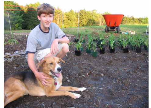
Planting seedlings with my uncle's dog

My favorite daylily is Sprinkled With Paprika from Gold Coast Daylilies in California. It was a purple ribbon winner at the Daylily Exhibition last summer. Stippled daylilies are my favorite and I hope I can hybridize more of them. I also really like daylilies with very small flowers, such as Cricket. A really small stippled daylily would be cool! And if it were blue, it would be even better! I've got a new batch of seeds to plant this winter. And next summer I'll be moving my plants from my aunt's house in Vermont to our new house in New Hampshire. I hope they do well in their new home.