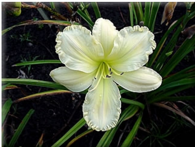
VINA S. SIMMONS (Shooter, J'01) Dip 26" M-RE-Dor 7" Large cream with chartreuse center, ruffled. Value: $45