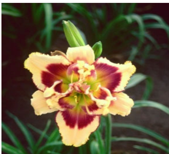
TOPGUNS ANITA CAUSEY (Scott, R'04) Tet 28" M-RE-Sev 5.75" Yellow double with burgundy eye and edge above yellow-green throat. Value: $125

Carl and Elaine Wickstrom Door Prize Chairs