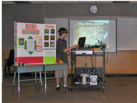
Presenting to the schoolboard

I did really well on my 8th Grade Challenge at school, and one of my teachers asked me to present my project to the School Board. I also planted some of my seedlings in the perennial garden in front of the school. I hope they didn't end up with a prize-winning hybrid!