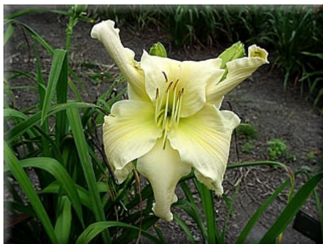
CANDLE IN THE WIND (Shooter, E'01) Dip 25" M-RE-Dor 6.5" Cream yellow variant, lime green throat, sepals twist. Value: $32