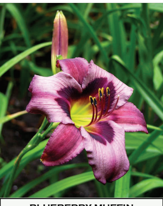
BLUEBERRY MUFFIN