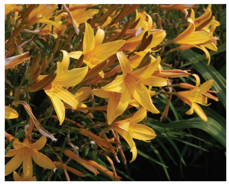
1st Place - Aurantiaca (Below) 2nd Place - Redheaded Hussy