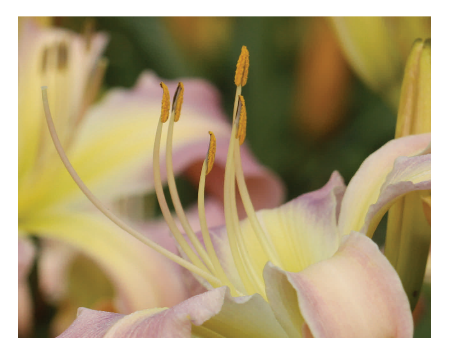
1st Place (tie) - Breathing In Snowflakes

1st Place (tie) - SHEZA HEARTBREAKER